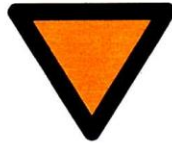
Beak -1 orange