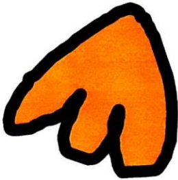
Foot shape - 2 orange